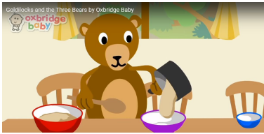
Screen shots of the animated story by Oxbridge Baby.