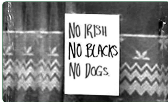
© 1951 James Bruce for Exhibition The Empire Windrush and Caribbean Migration | © Windrush Foundation 2018